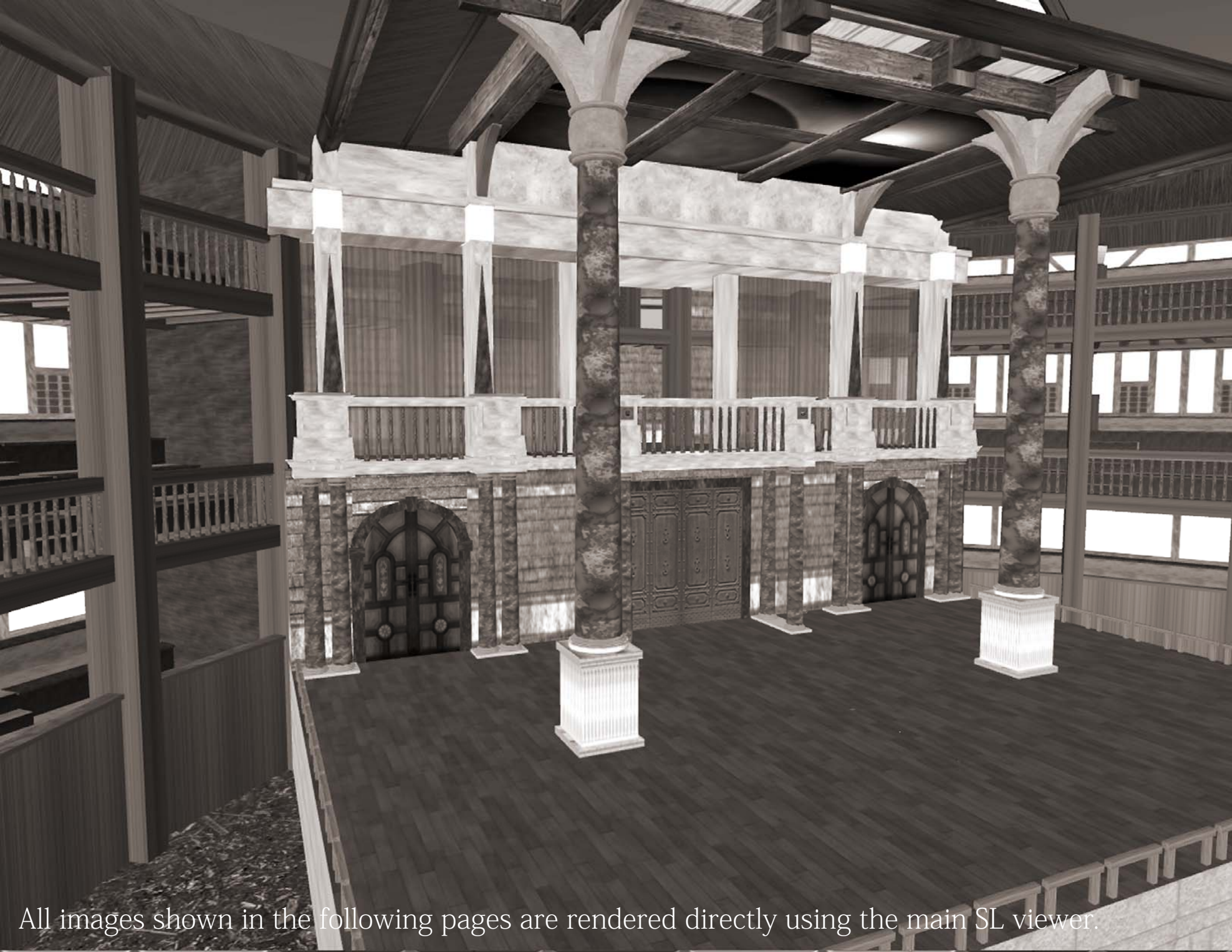
All images shown in the following pages are rendered directly using the main SL viewer.